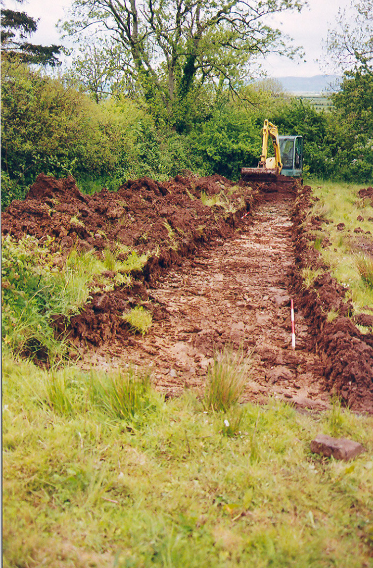
Photo 5: Trench 4 looking northwest after excavation showing surface of subsoil (Context 402).