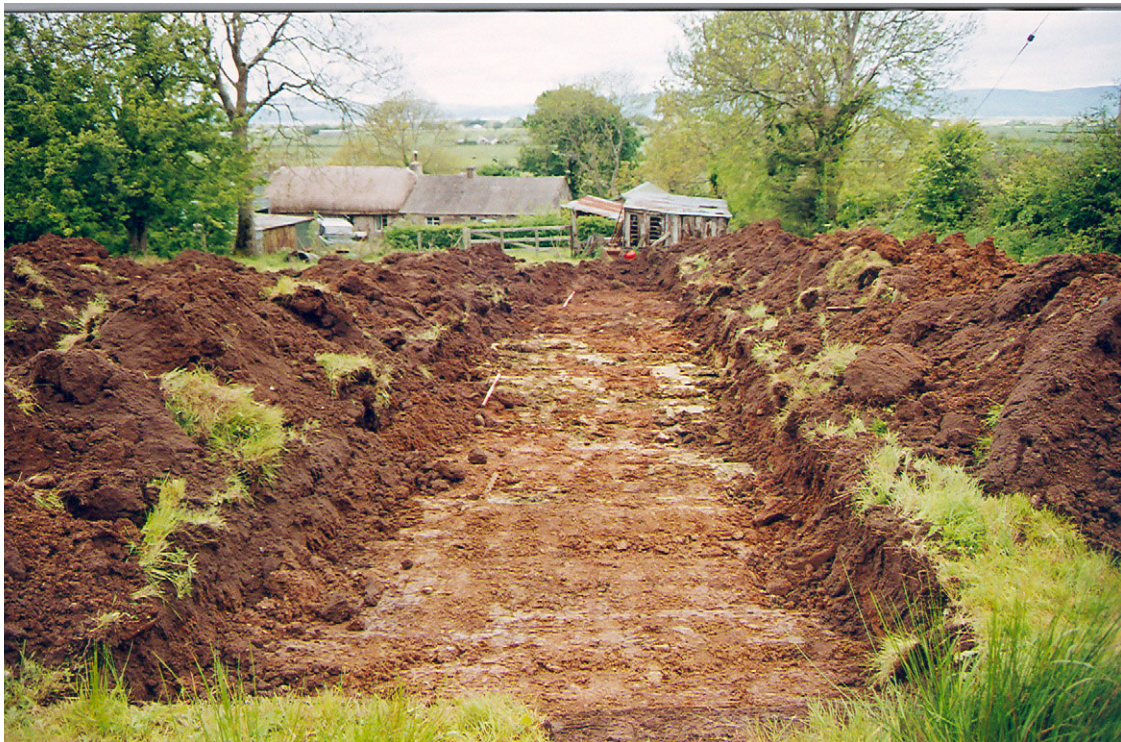
Photo 2: Trench 1 looking northwest after excavation showing surface of subsoil (Context 102).