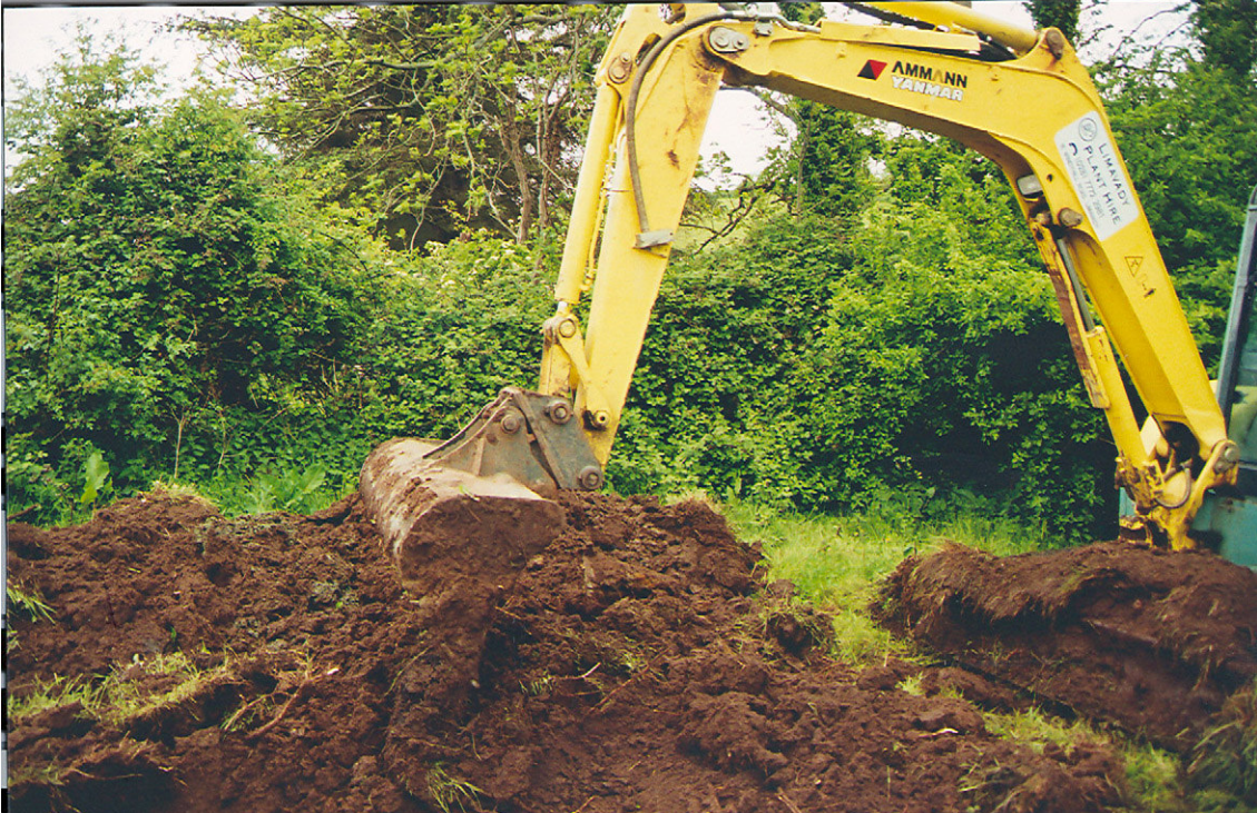
Photo 1: Excavation of Trench 1 showing utilization of toothless “sheugh” bucket.