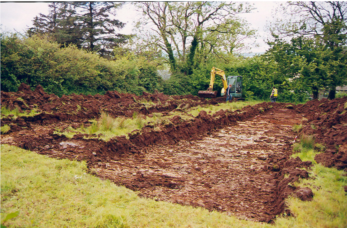
Photo 4: Trench 3 looking northwest after excavation showing surface of subsoil (Context 302).