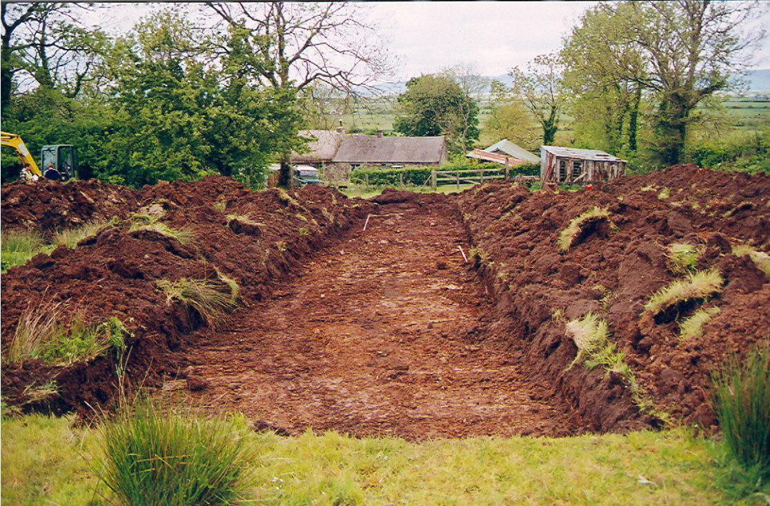
Photo 3: Trench 2 looking northwest after excavation showing surface of subsoil (Context 202).