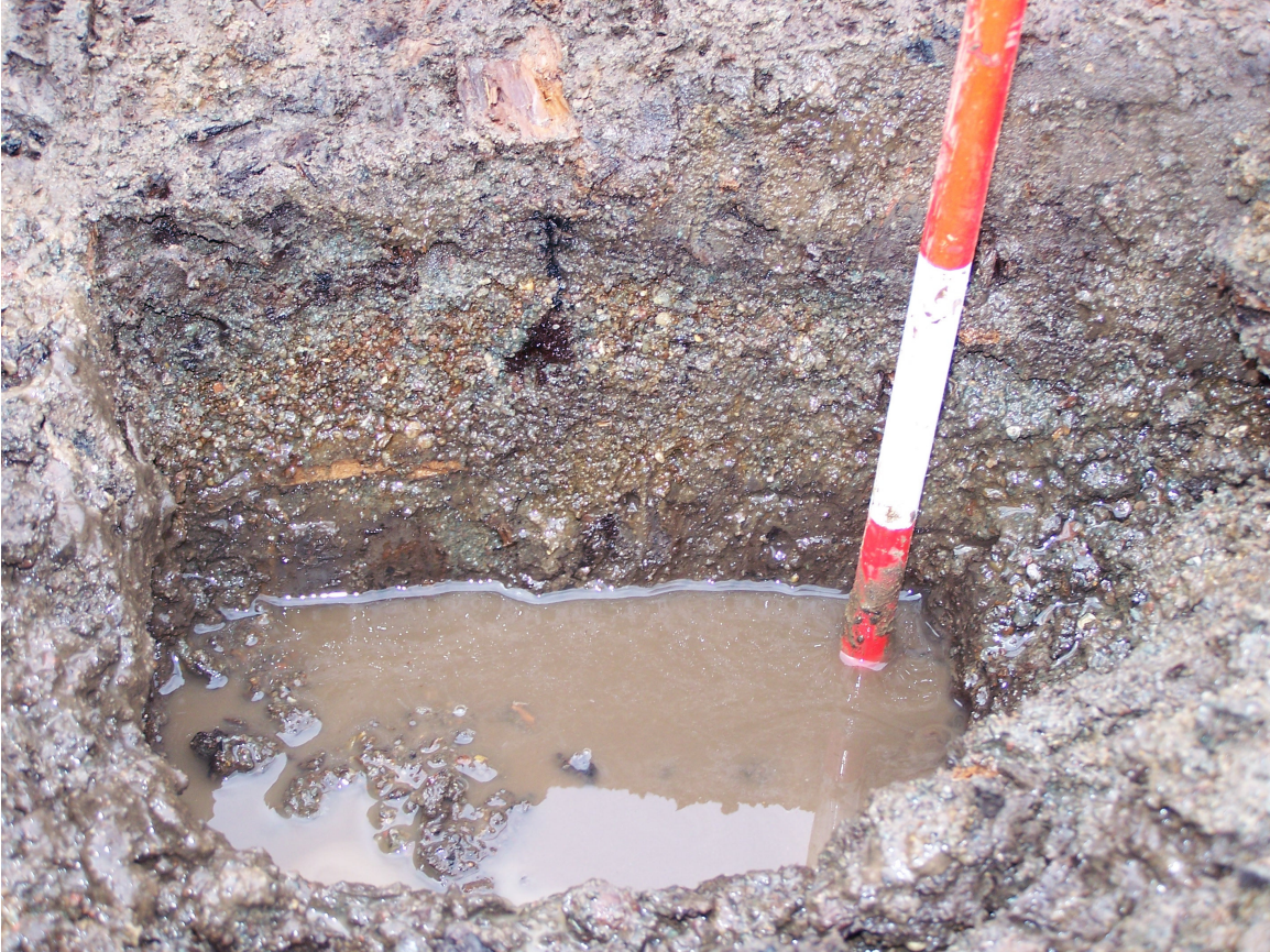
Plate 3 Section from Trench C showing the layers of brush and shale encountered above the peat deposit (Context No. 310).