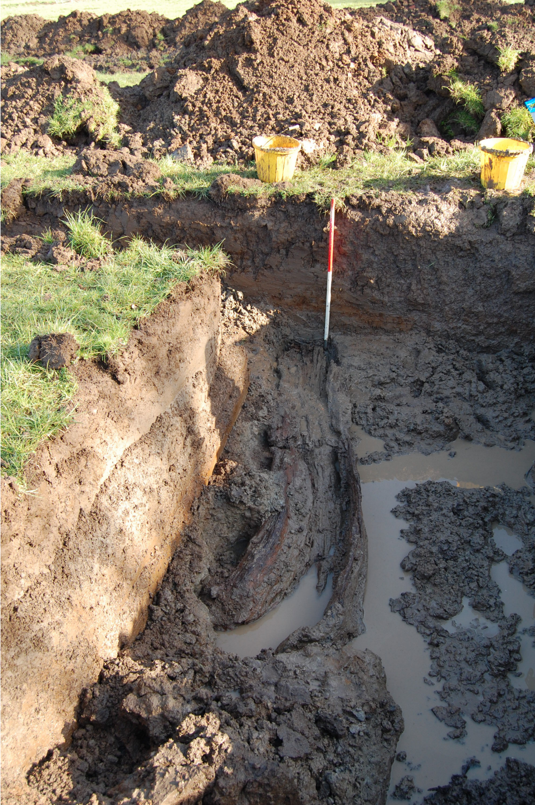
Plate 5 General shot of the timber during excavation looking north.