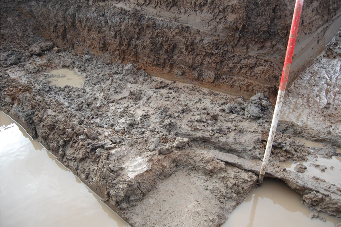
Plate 4 Excavation of timber (Context No. 406) from the fine grey sandy clay of Trench D.