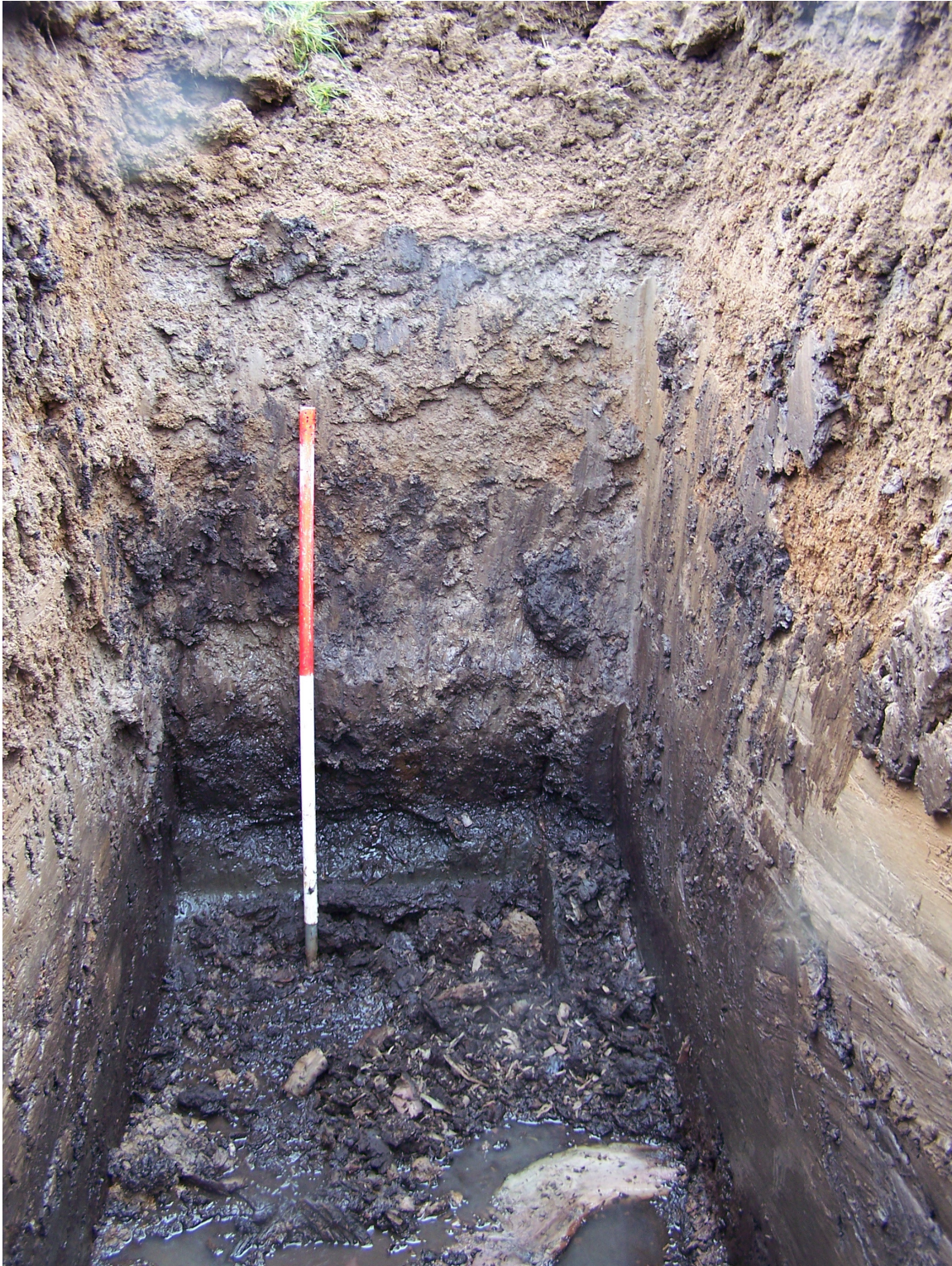
Plate 2 Section from Trench A showing the depth of basal peat deposits (Context No. 106).