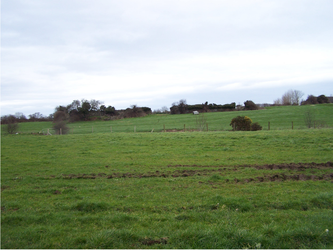
Plate 1 Looking north towards Portmore Castle (062:007) from the proposed development site. The fence in the foreground represents the modern river bank.