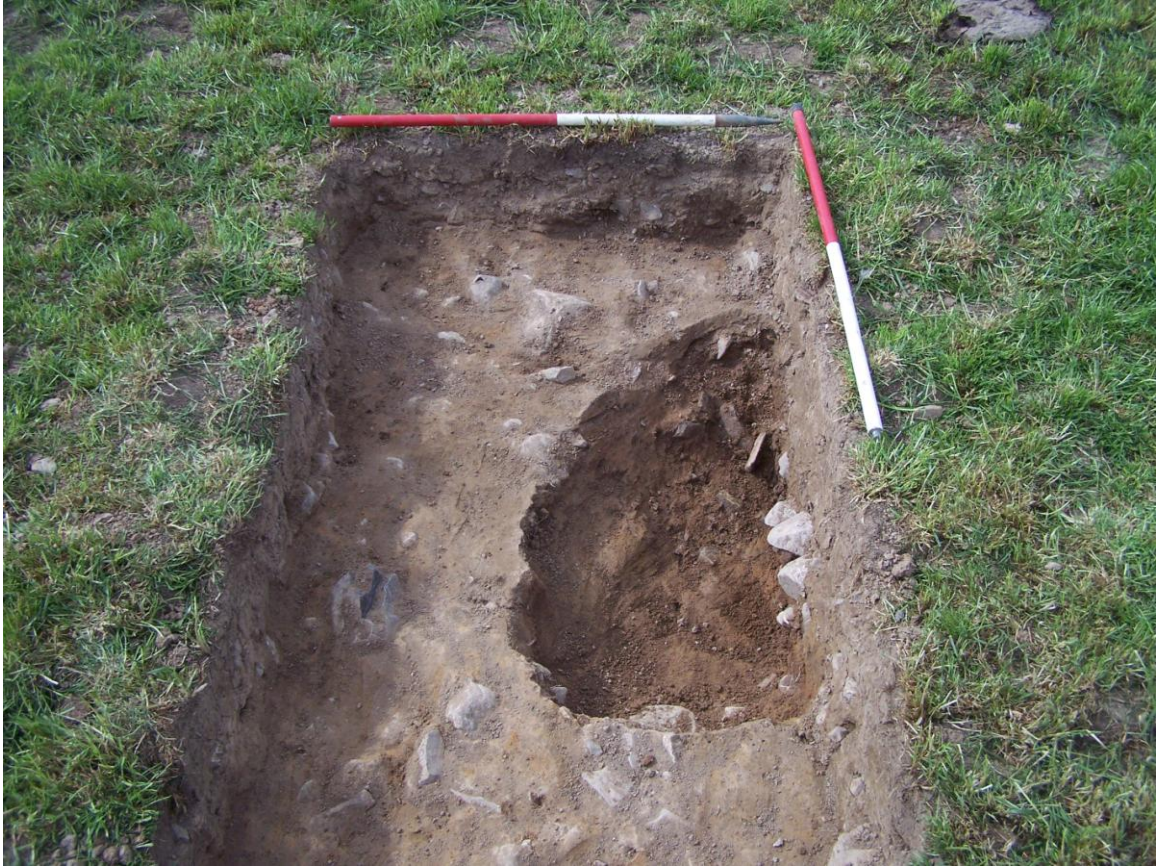
Plate 2: Trench 2 following excavation to the surface of the natural subsoil, looking south. The irregular pit/possible tree hole is visible along the western edge of the trench.