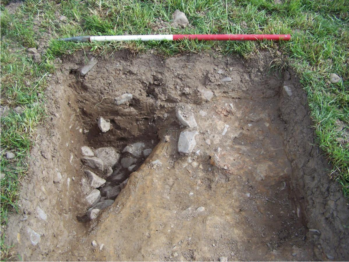
Plate 1: Trench 1 following excavation to the surface of the natural subsoil, looking north. The modern field drain (Context No. 104) is visible in the north-western corner of the trench.