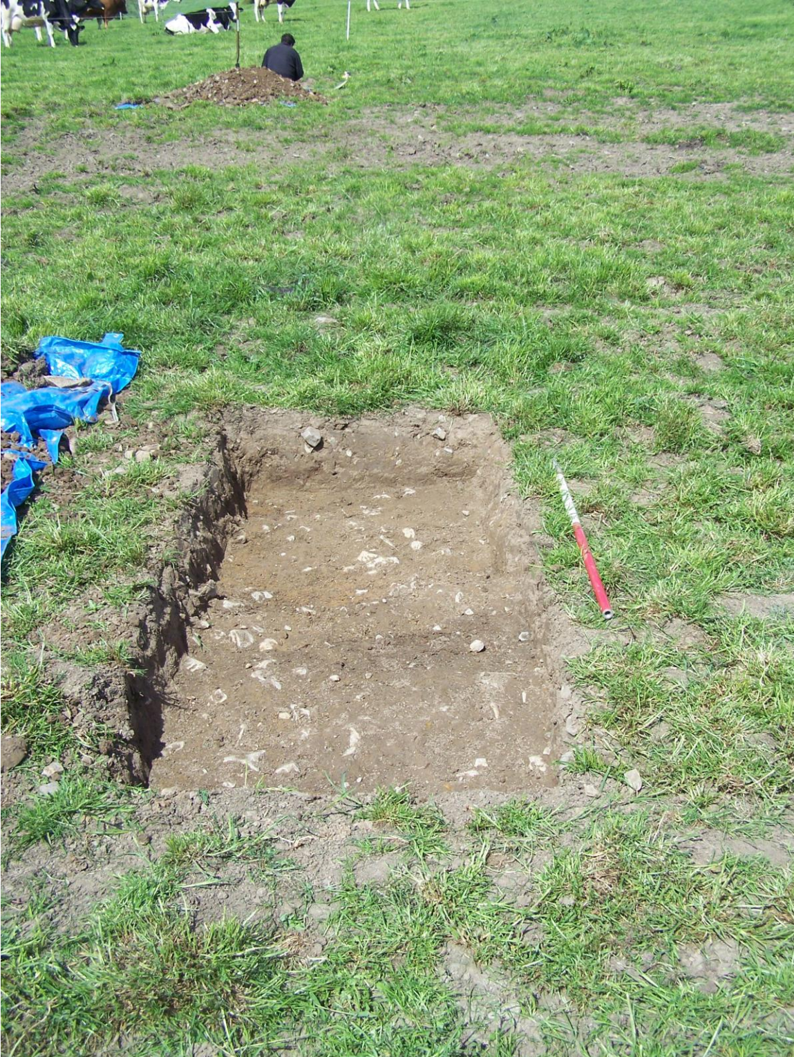
Plate 5: Trench 4 following excavation to the surface of the natural subsoil, looking north.