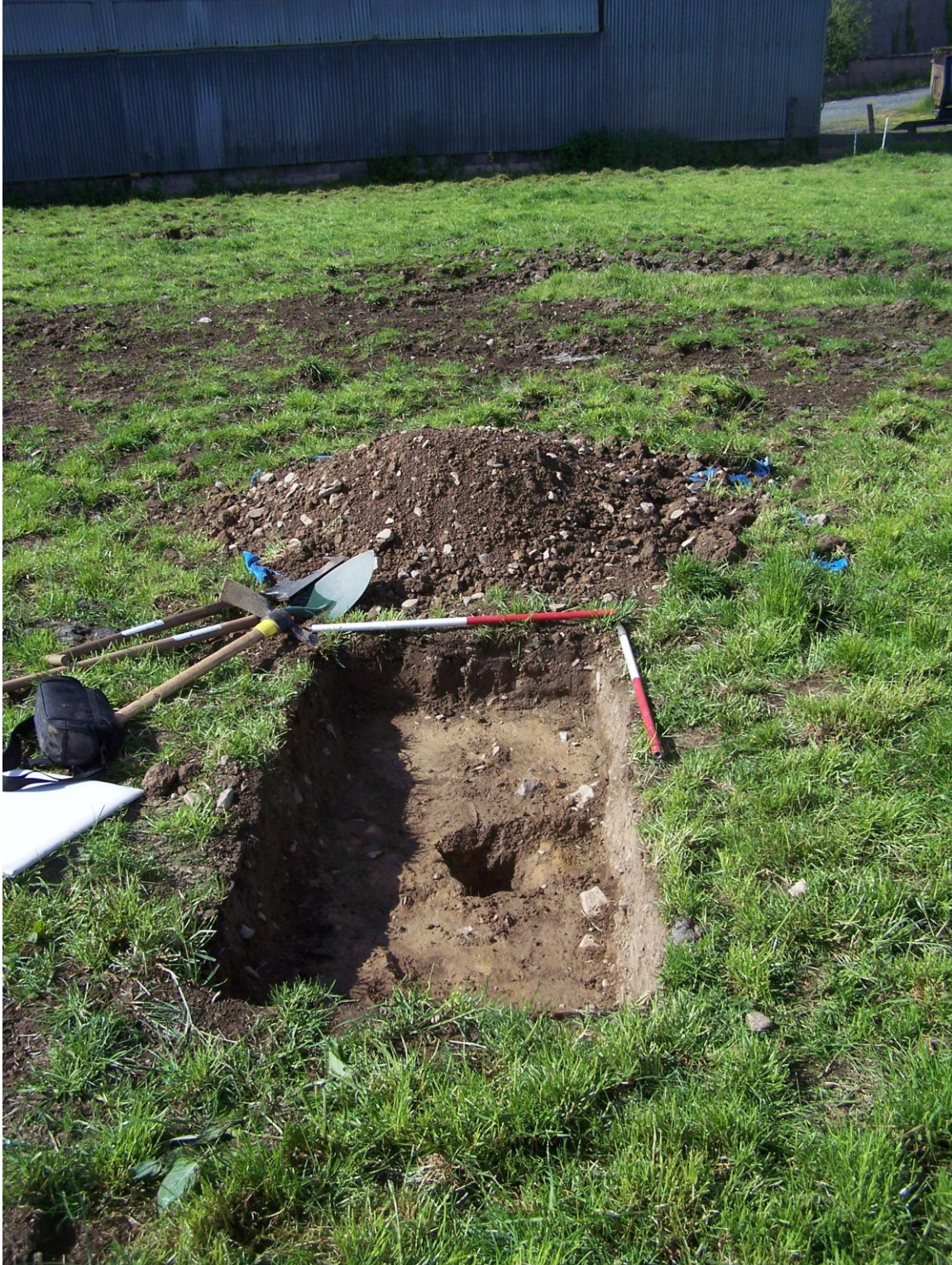
Plate 4: Trench 3 following excavation to the surface of the natural subsoil, looking south. The modern field drain (Context No. 303) is visible about the middle of the trench.