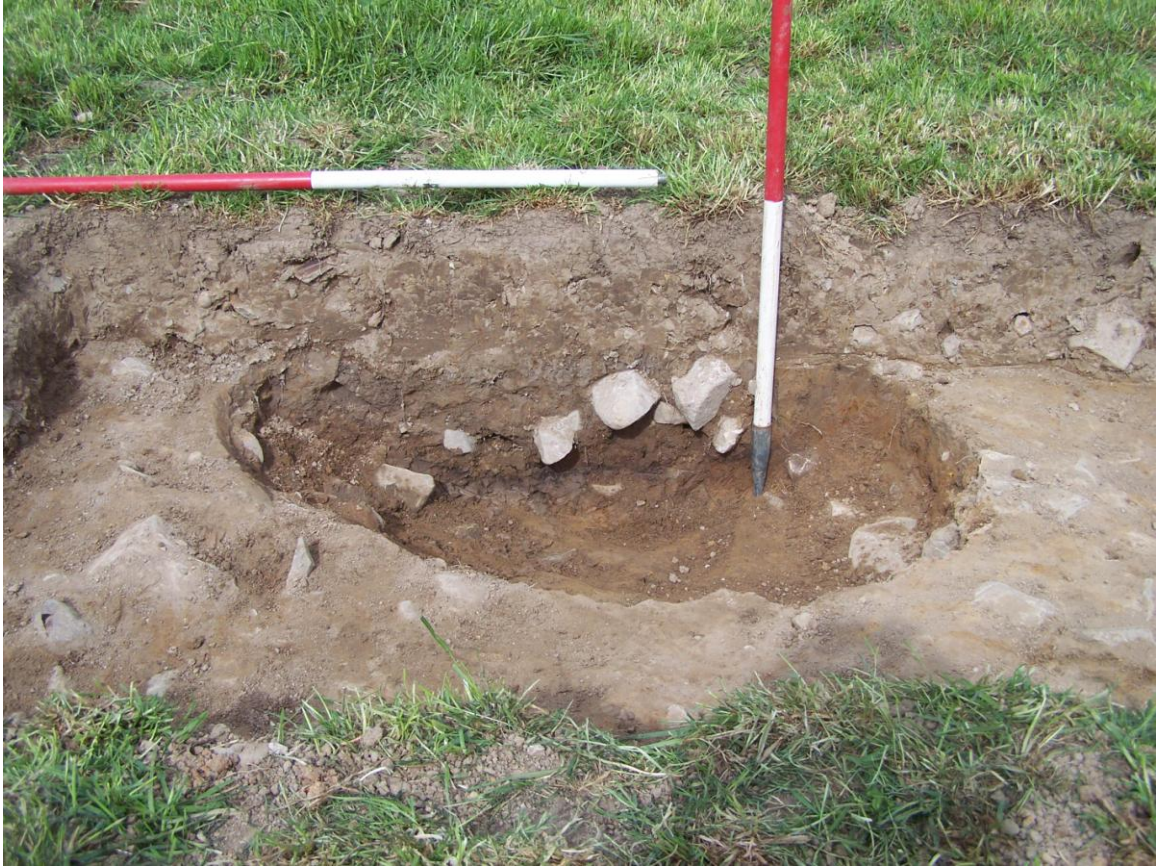
Plate 3: East facing section of Trench 2 showing the irregular pit feature (Context No. 203).