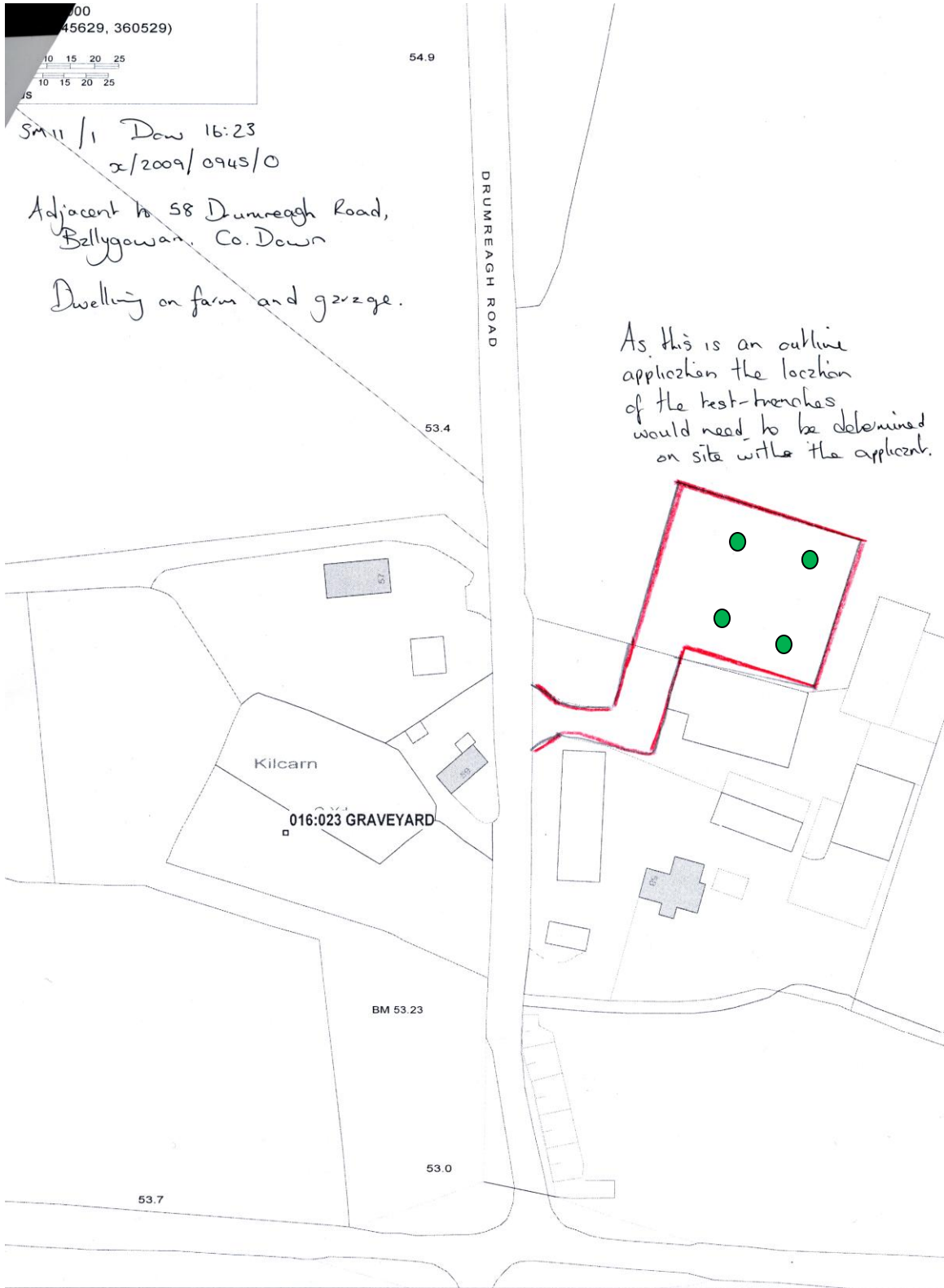
Fig. 3: Site plan showing development area (highlighted in red). The approximate location of the trenches is depicted by green dots.