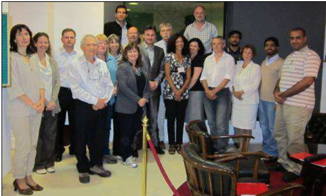
Photograph 1: IUGS IFG committee members at the IFG inaugural meeting, held in Rome, 18-19 September 2011