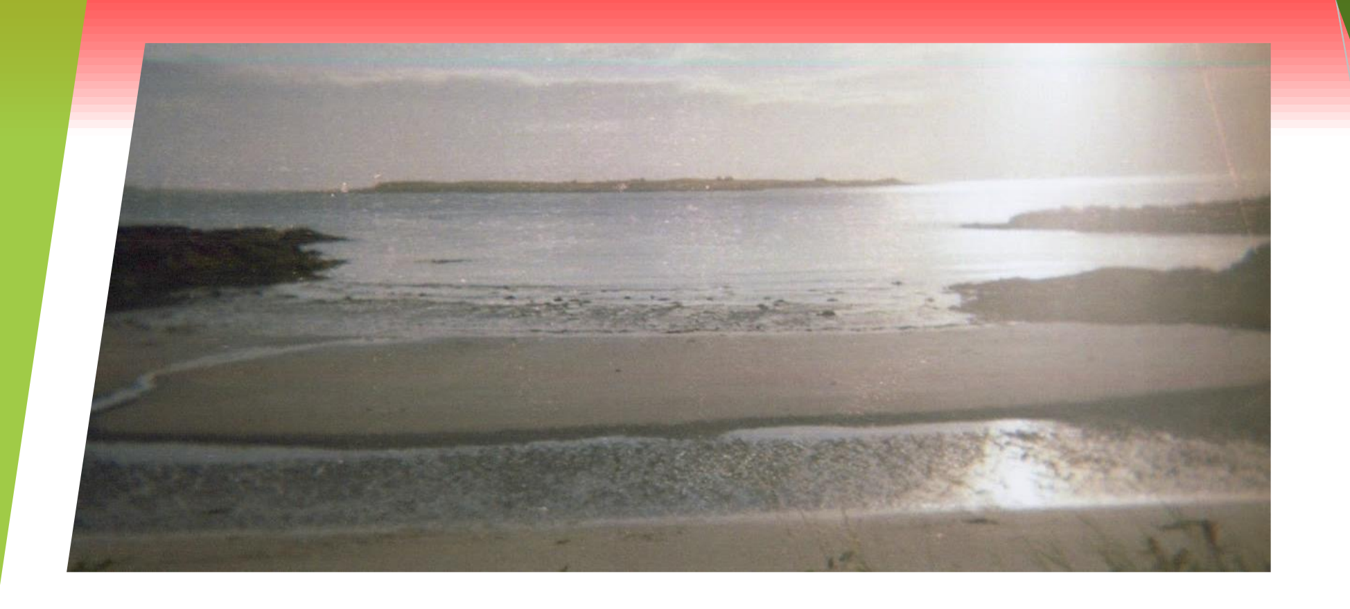
I feel very much at home, the sea blinking always.